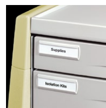
Drawer Label Holder