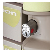
Best® Core Locks*